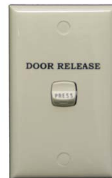
Momentary Release Switch