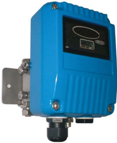
Front Viewing Die Cast Zinc Alloy Intrinsically Safe Model Available