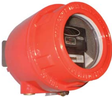
Exd Flameproof Front Viewing Copper Free Aluminium Alloy