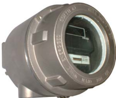
Exd Flameproof Front Viewing Stainless Steel (316)